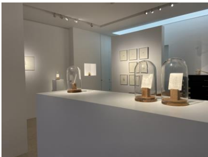
Installation View: Temitayo Ogunbiyi, "Capillarité", 2019.