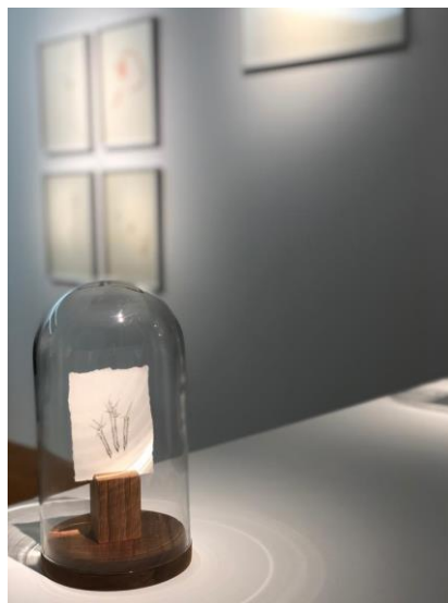
Installation View: Temitayo Ogunbiyi, "Capillarité", 2019.