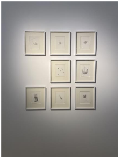
Installation View: Temitayo Ogunbiyi, "Capillarité", 2019.