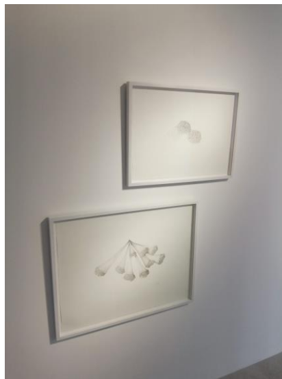
Installation View: Temitayo Ogunbiyi, "Capillarité", 2019.