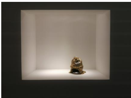
Installation View: Temitayo Ogunbiyi, "Capillarité", 2019.