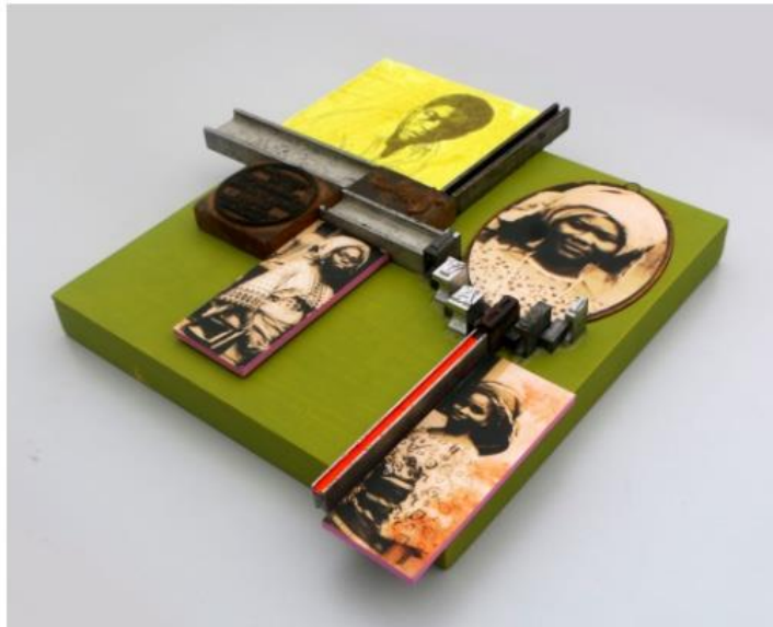
Kelani Abass, 'Igbayi', 2020, mixed media on wood. Courtesy of 31 Project

The works in this exhibition extend Abass' foray into the shared history and the relationship between man and machines. These works, reflecting his inquisitive mind, represent his enquiry into time across generations, featuring people from his community.